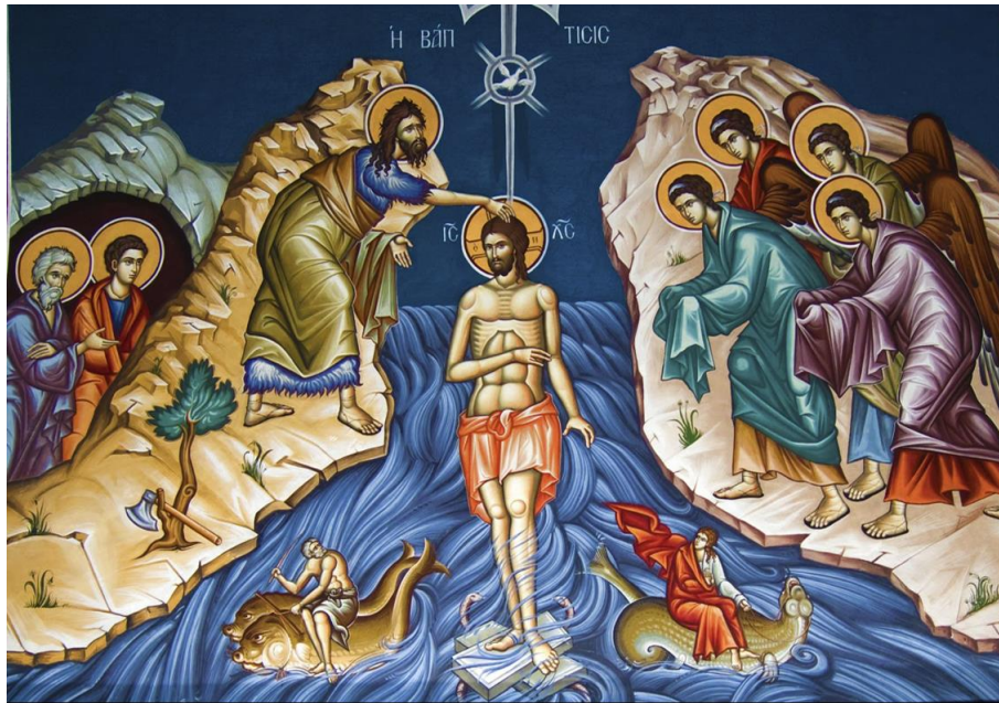
The Baptism of Christ